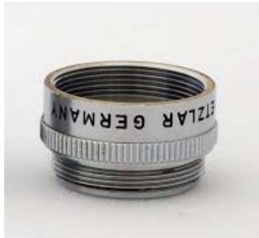
Figure 3: Leitz PLEZY adapter.

From the same Inter-Office Memorandum we can learn that newer oculars should not be used on older Leitz microscopes. Of course, when using an adjustable monocular viewing port, one may still be able to use newer Leitz oculars by appropriately reducing the mechanical tube length.